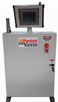
▲ Top: Drawings from the first-generation servo stacker patent Liberty Glass Co. filed for in 1991. Middle: Pyrotek's Servo 9000 Stacker. Bottom: Pyrotek's custom-built control panel and touchscreen for the Servo 9000 Stacker.