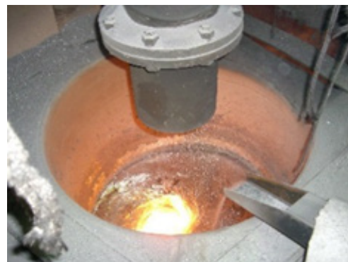
After: Pyrotek's LOTUSS system continuously melts scrap

The results were a very high recovery rate and a 3 percent yield improvement compared to the conventional manual method.