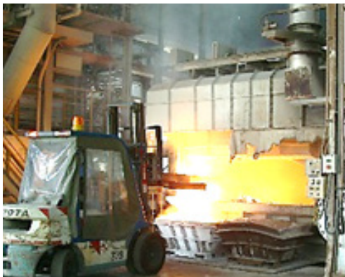
Before: manual method of melting scrap