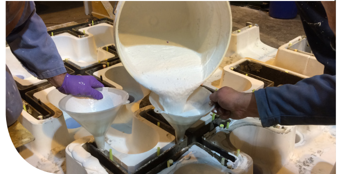
Pyrotek Wollite backup insulation being poured.

Setting time for Wollite 30 ST-1 and the competitor's product were measured using both observational and quantitative methods. For the quantitative method, a Brookfield viscometer identified the point at which the foam around the viscometer spindle solidified. Observationally, setting time was noted when the liquid was too viscous to be poured.